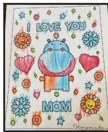
Elliott Weatherup, age 4

THESE HOLIDAYS: EASTER, MOTHER'S DAY, FATHER'S DAY, HALLOWEEN, CHRISTMAS, AND VALENTINE'S DAY.