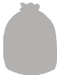
One (1) grocery sized privacy bag within the clear bag