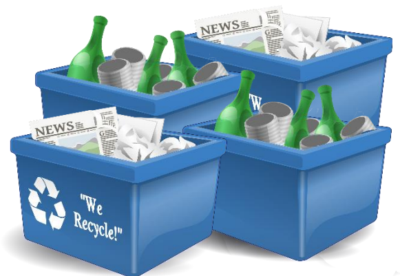
Unlimited recycle bins sorted into fibres and containers

SEE REVERSE FOR ADDITIONAL INFORMATION REGARDING THE CLEAR BAG PROGRAM